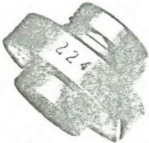
Order Number 224 111 850

for pressing chain sprocket onto crankshaft (in conjunction with spindle, Tool Number 535)