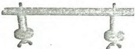
Order Number 226 112 810

for centering timing case cover and driving in radial sealing ring for camshaft sealing into cover