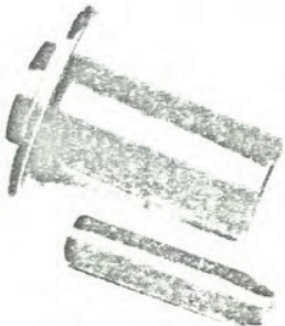
Order Number 225 111 820

for driving in the radial sealing ring for the crankshaft into the timing case cover